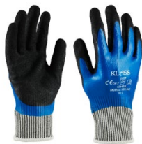
Glove model TEK541

EN ISO :21420:2020 & Dexterity 5 EN 388:2016 +A1:2018 (4X43D)